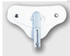
ST Sternal Pad