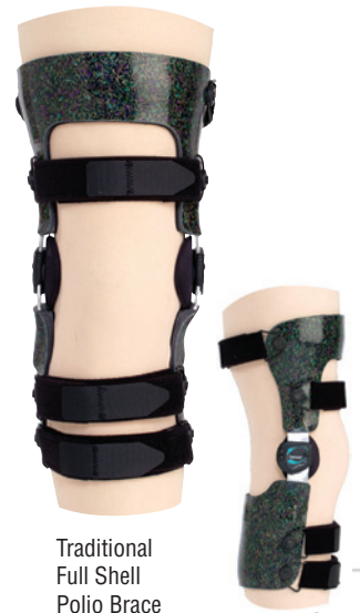
Traditional Full Shell Polio Brace