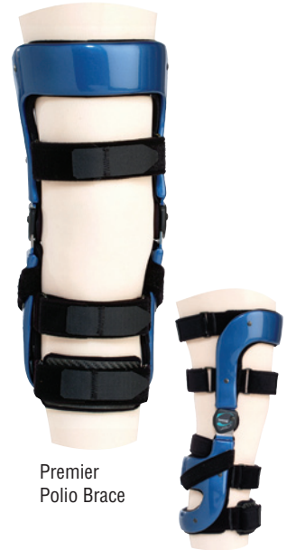
Premier Polio Brace

The unique attachment of the Synergistic Suspension Strap is beneficial for brace suspension. The strap attaches to the posterior shell and wraps around the inside of the uprights.