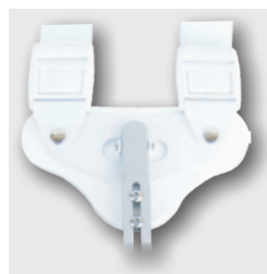
EXT STH White Straps