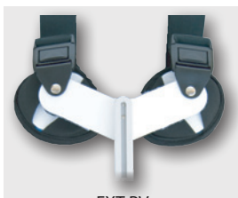
EXT PV Black Straps Soft Covers