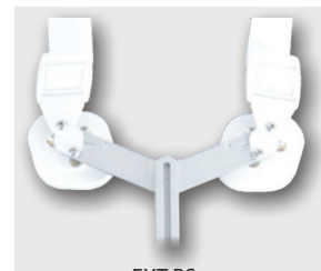
EXT PS White Straps