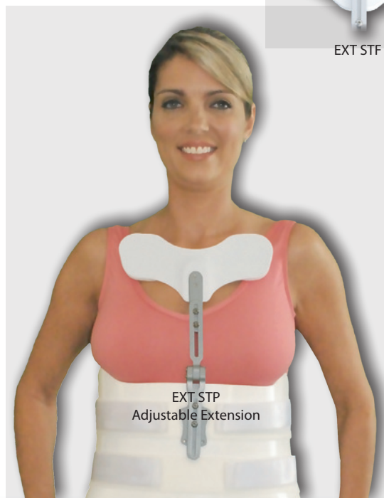
EXT STP Adjustable Extension