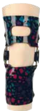
Full shell trigger lock brace.