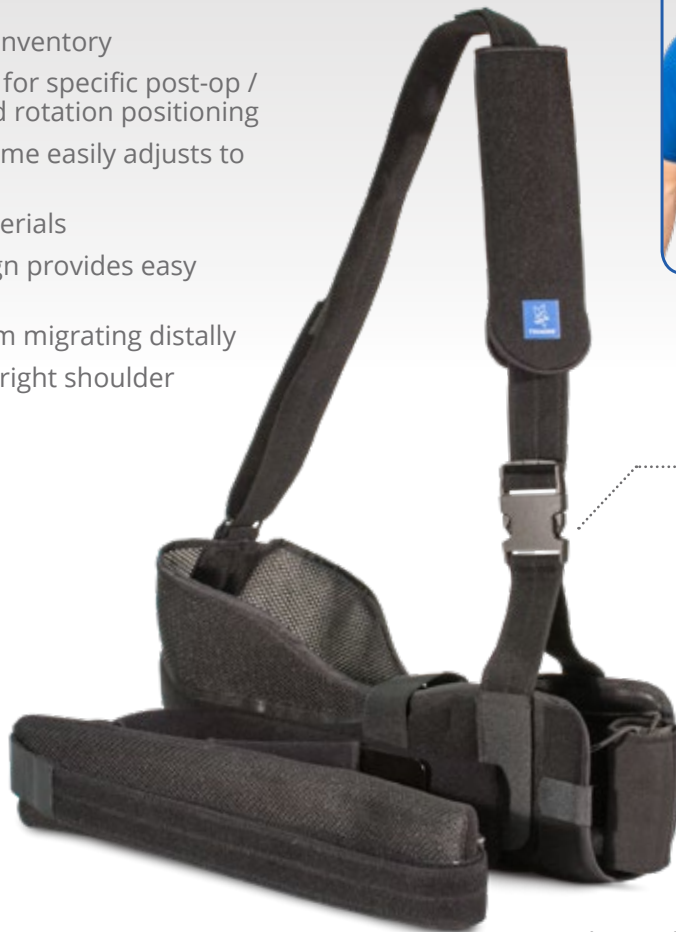
Light weight, breathable materials