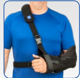
Step down capability