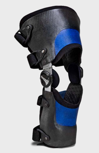
Full Shell OA