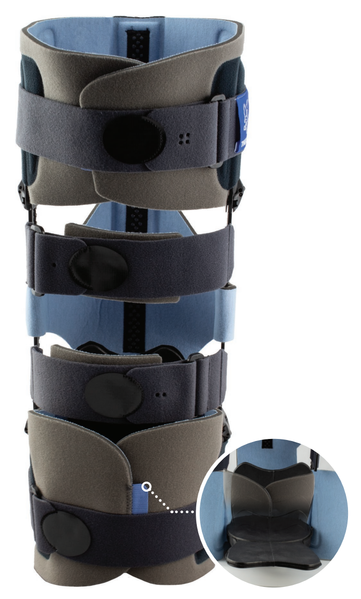
The residual limb is protected by a cushioned plate at the distal end of the brace